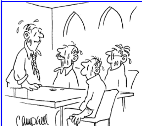
"And on the matter of a new air conditioning system, the hallelujahs have it!"